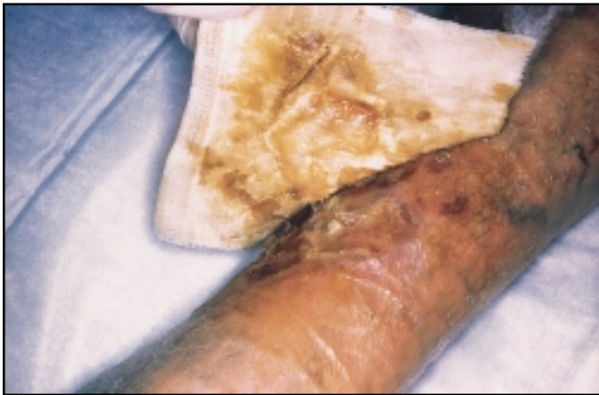
Fig. 1. The debriding action of honey detaches slough so that it lifts off with the dressing.

supply of glucose which is essential for the 'respiratory burst' of phagocytes.