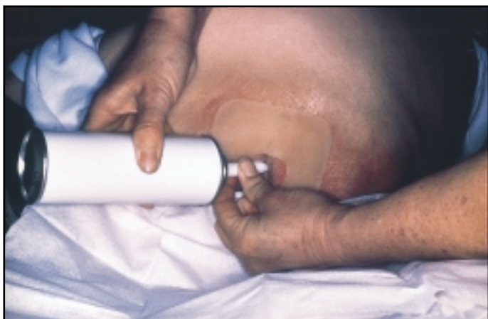
Fig. 4. A pressurized system being used to fill a sinus with sterilized honey.