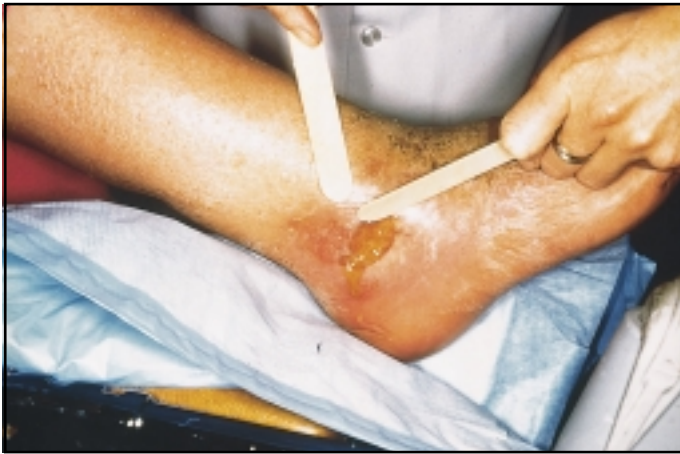
Fig. 2. Honey applied directly to surface wounds tends to run off.

gen peroxide has been found to stimulate the proliferation of fibroblasts. [64] It has been proposed that hydrogen peroxide could be used to promote the wound healing process if the concentration could be carefully controlled: [64] controlled sustained release of hydrogen peroxide is achieved with honey. It has also been proposed that honey be used in place of recombinant growth factors to stimulate the healing of burns. [65]